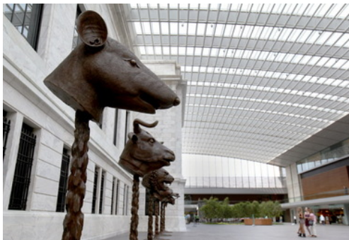
The rat and ox, left and second from left, are among the large Chinese zodiac sculptures by artist Ai Weiwei inside the atrium of the Cleveland Museum of Art.

Akron Art Museum. 1 S. High St. 330-376-9185 or akronartmuseum.org