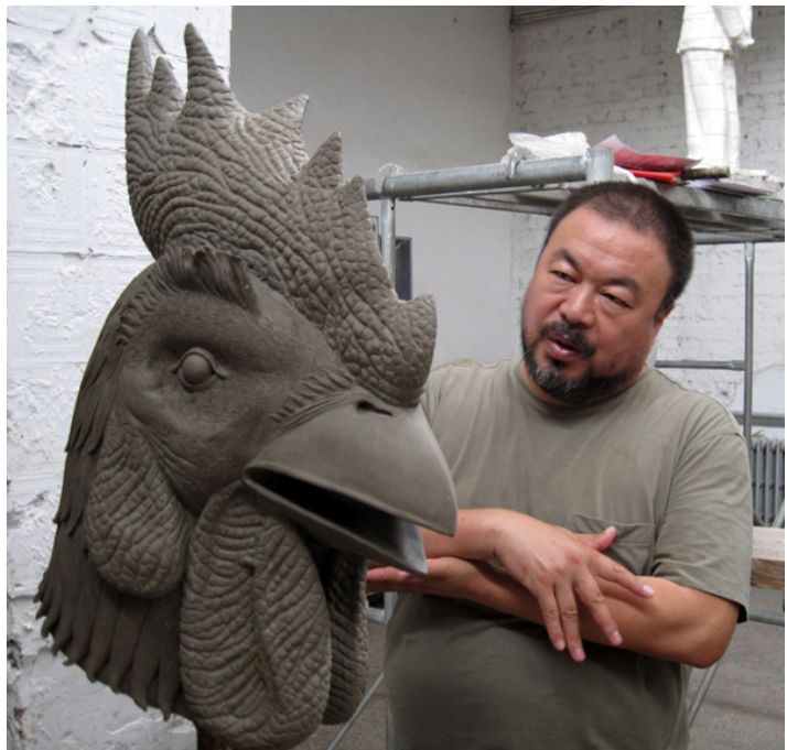
Chinese contemporary artist and political dissident Ai Weiwei with the Rooster Head mold of his Zodiac Heads: Bronze collection